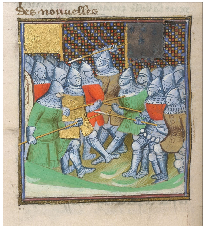
The original manuscript with battle scene.