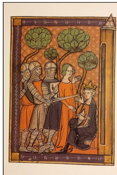
The original image featured in A History of Illuminated Manuscripts